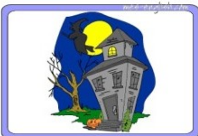
a haunted house