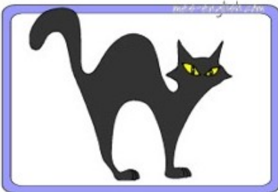
a black cat