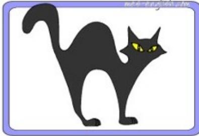
a black cat