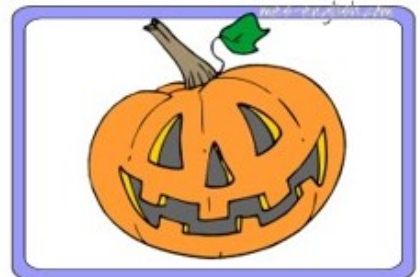
a Jack'o lantern