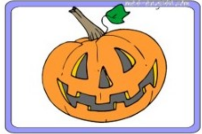
a Jack'o lantern